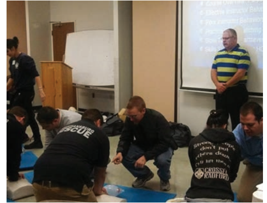
CPR training in Christiansburg.